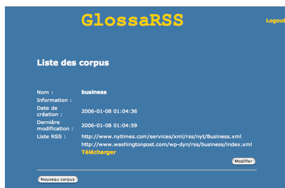
Figure 8. Online service for building RSS-based corpora

Linguists may find command line tools hard to use. For this reason, we have also developed a Web-based interface for facilitating RSS-based corpus development. GlossaRSS provides a simple Web interface in which users can create “corpus-acquisition tasks”. They just choose a name for the corpus, provide a list of URL corresponding to RSS feeds and activate the download. The corpus will grow automatically over time and the user can at any moment log in to download the latest version of the corpus. For efficiency reasons, the download managing program checks that news feeds are downloaded only once. If several users require the same feed, it will be downloaded once and then appended to each corpus.