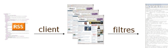
Figure 5. Corporator Process

Corporator 18 is a simple command line program which is able to read an RSS file, find the links in it and download referenced documents. All these HTML documents are filtered and gathered in one file as illustrated in Figure 5.